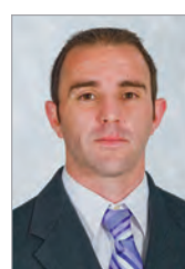
Chuck Williams Women's Cross Country