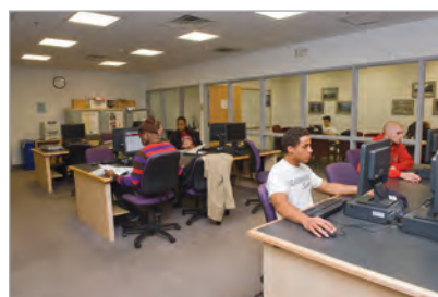
Marist Vice President of Student